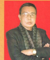
Sorokhaibam Rajen Singh Hon'ble Minister of Education Manipur